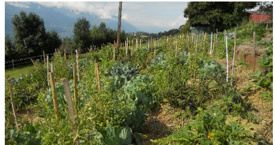
An allotment in Wallis (CH) showing 16 experimental plots and 12 different mixed cultures.

Unfortunately, it was not possible to supply the biochar until it was relatively late into the season. Some participants had already cultivated the beds, and as a result, out of the 180